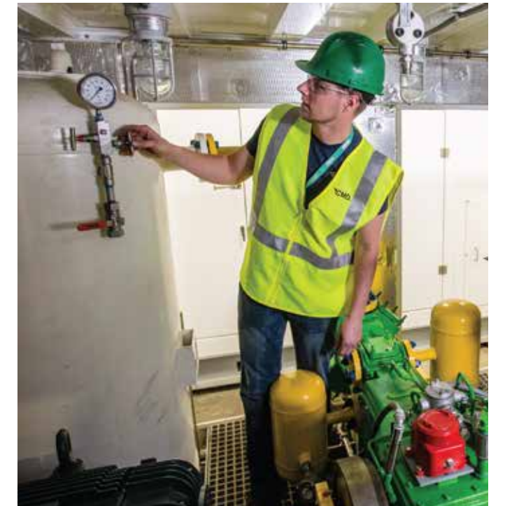
Ergonomic & Efficient